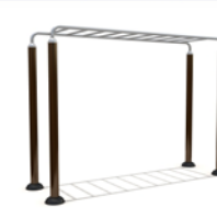
Overhead Ladder (FTV-086)