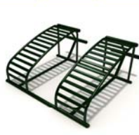
Double Sit-up Trainer (FTV-060)