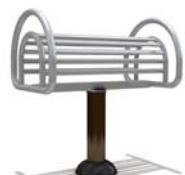
Back Stretch (FTV-101)