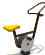
Limbs Warm up Trainer (FTV-106)