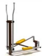
Elliptical Cross Trainer (FTV-078)