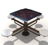
Chess Table (FTV-089)