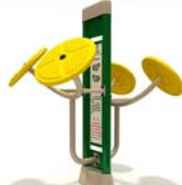
Taichi Standing Rotator (FTV-122)