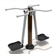
Double Surfboard (FTV-095)