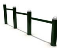
Leg Presser Trainer (FTV-044)