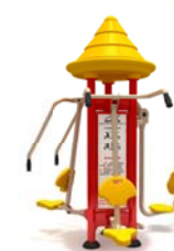
Multifunction Trainer (FTV-135)