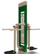
Double Surfboard (FTV-111)