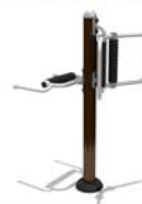
Waist & Back Massager (FTV-093)