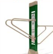
Double Parallel Bar (FTV-118)