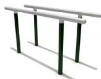
Parallel Bars (FTV-039)