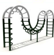
Jungle Gym (FTV-065)