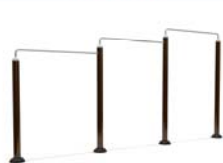
Triple Uneven bar (FTV-075)