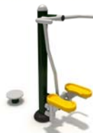
Hip Twister & Stepper (FTV-034)