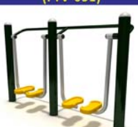
Double Air Walker (FTV-051)