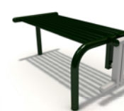
Abs & Lower Legs Trainer (FTV-047)