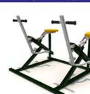
Double Fun Rider (FTV-054)