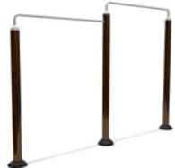
Uneven bar (FTV-074)