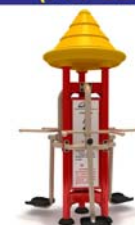
Triple Surfboard (FTV-128)