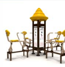
Rower Station (FTV-145)