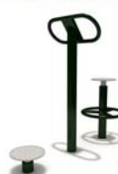
Uneven Hip Twister (FTV-061)