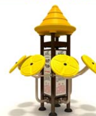
Taichi Trainer Station (FTV-140)