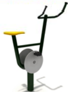
Limbs Warm up Trainer (FTV-029)