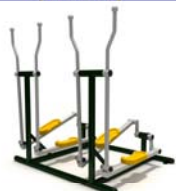
Double Elliptical Cross Trainer (FTV-056)