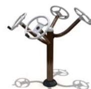
Standing Rotator (FTV-108)