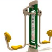
Seated Leg Press (FTV-112)