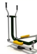
Elliptical Cross Trainer (FTV-070)