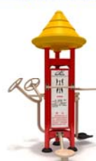
Multifunction Trainer (FTV-132)