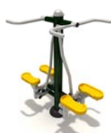
Double Stepper (FTV-035)