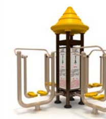
Air Walker Station (FTV-146)