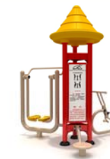
Multifunction Trainer (FTV-136)