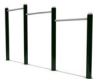
Triple Uneven bar (FTV-038)