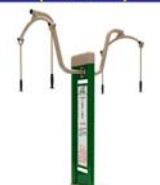
Upper limbs Stretcher (FTV-124)