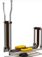
Elliptical Cross Trainer (FTV-083)