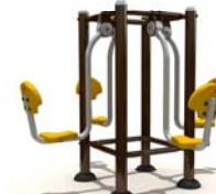
Triple Leg Presser (FTV-099)