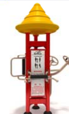
Multifunction Trainer (FTV-133)