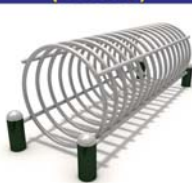
Crawling Tunnel (FTV-049)