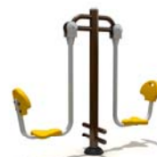
Seated Leg Press (FTV-098)