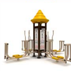
Air Skier Station (FTV-139)