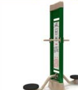
Double Twister (FTV-119)