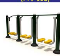
Triple Air Walker (FTV-052)