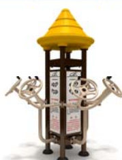
Standing Spinner Station (FTV-143)