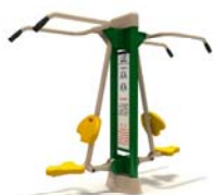
Lat Pull Down (FTV-110)