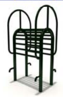
Waist and Back Stretcher (FTV-046)