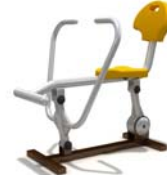
Rower Trainer (FTV-104)