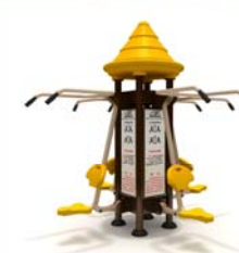
Lat Pull Down Station (FTV-141)