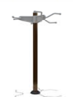
Triple Chin up (FTV-087)