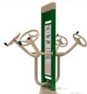
Standing Rotator (FTV-121)