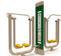
Double Air Walker (FTV-114)