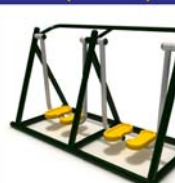
Double Air Walker (FTV-053)