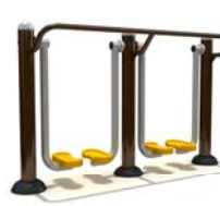
Double Air Walker (FTV-082)