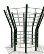
Climbing Station (FTV-067)