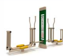
Double Air Skier (FTV-113)