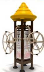
Shoulder Wheels Station (FTV-142)