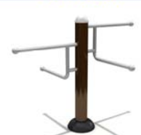
Leg Presser (FTV-084)