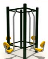
Quadruple Leg Presser (FTV-059)