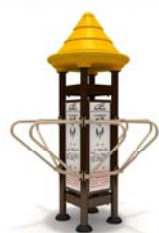
Dip Bars Station (FTV-138)