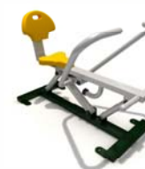
Rower Machine (FTV-071)