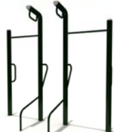
Multifunction Trainer (FTV-064)