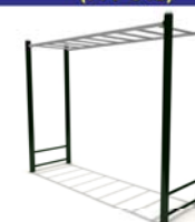
Overhead Ladder (FTV-041)