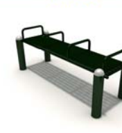
Pommel Horse Trainer (FTV-069)