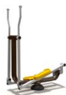
Air Skier (FTV-079)