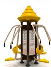
Seated Chest Press Station (FTV-144)