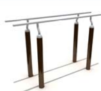
Parallel Bars (FTV-076)