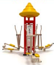
Triple Elliptical Cross Station (FTV-130)