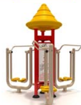
Triple Air Walker Station (FTV-126)