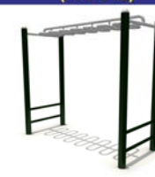
Overhead Ladder (FTV-042)