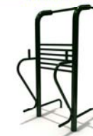
Multifunction Trainer (FTV-063)