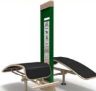
Sit-up Trainer (FTV-116)