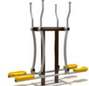
Double Air Skier (FTV-100)