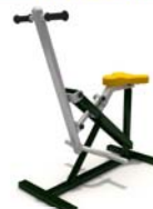
Amusement Rider (FTV-021)