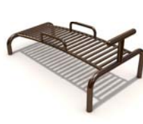
Sit-up Trainer (FTV-107)