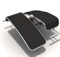
Sit-up Trainer (FTV-088)