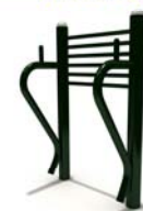
Abs Trainer (FTV-062)