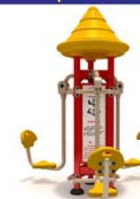
Triple Leg Press Station (FTV-129)