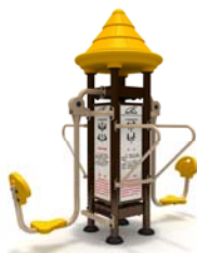
Multifunction Train Station (FTV-147)