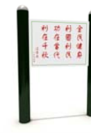
Sign Board (FTV-072)