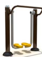
Air Walker Single (FTV-080)