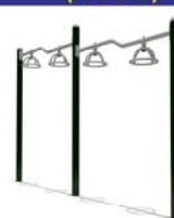
Hang Spinner (FTV-040)