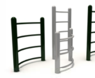
Climbing Frames (FTV-048)