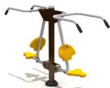
Lat Pull Down (FTV-096)