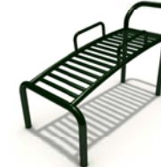
Sit-up Trainer (FTV-027)