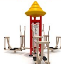
Triple Air Skier Station (FTV-127)