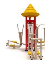
Multifunction Trainer (FTV-134)