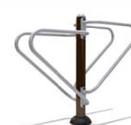
Double Parallel Bar (FTV-077)