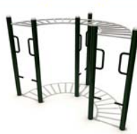
Curved overhead Ladder (FTV-066)