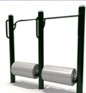
Double Legs Rolling Trainer (FTV-057)