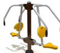
Double Seated Chest Press (FTV-097)