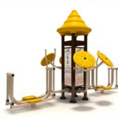
Multifunction Train Station (FTV-148)