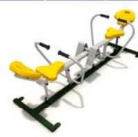
Double Rower (FTV-045)