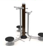
Triple Hip Twister (FTV-094)