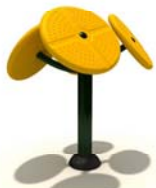
Taichi Standing Rotator (FTV-024)